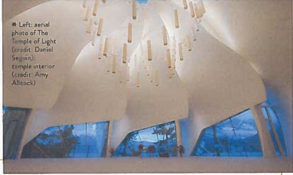
✦ Left: aerial photo of The Temple of Light; temple interior

choose to follow in life. When we are willing to step into this space and be in the Light of understanding, differences fall away. There is a remembrance of what it means to be human and the responsibility that comes with this – to understand the consequences of our actions and to make wise choices.